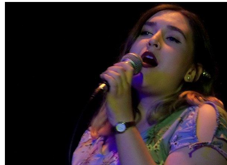
Singer Mia Reschke