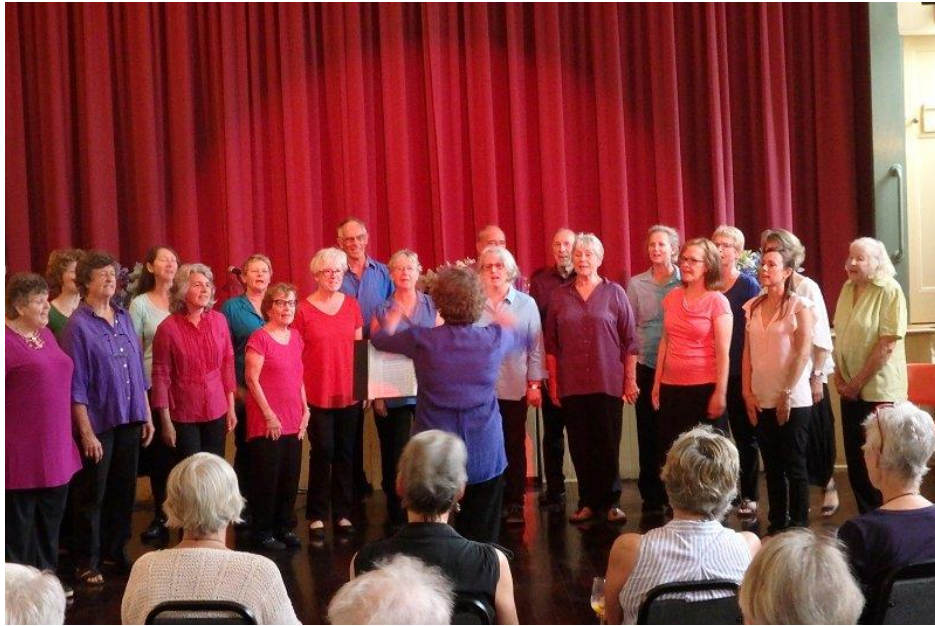
Fleurieu Singers at the launch