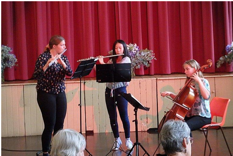
Adelaide Youth Orchestra trio