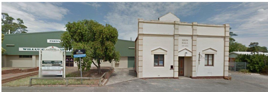
The Willunga Rec Centre and Show Hall, now the home of stars