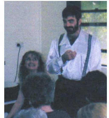
Tea Rose Duo