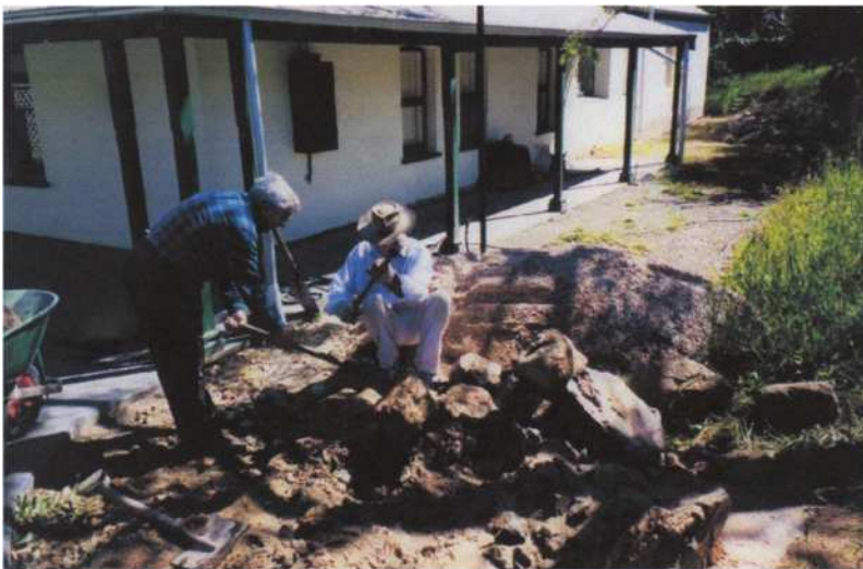
Onkaparinga Dedicating the 1870's Garden