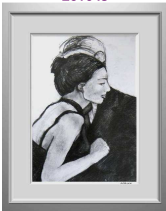
Charcoal on paper